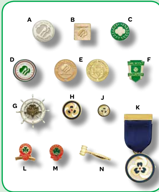
Contact your local Girl Scout Council for earning requirements.

D. USGS Overseas Pin. This pin is available to any girl or adult who is, or has been registered in a USA Girl Scouts Overseas committee. \frac{3}{4} " round. Goldtone steel with epoxy. Clutch back. Imported. 09060. $5.00.